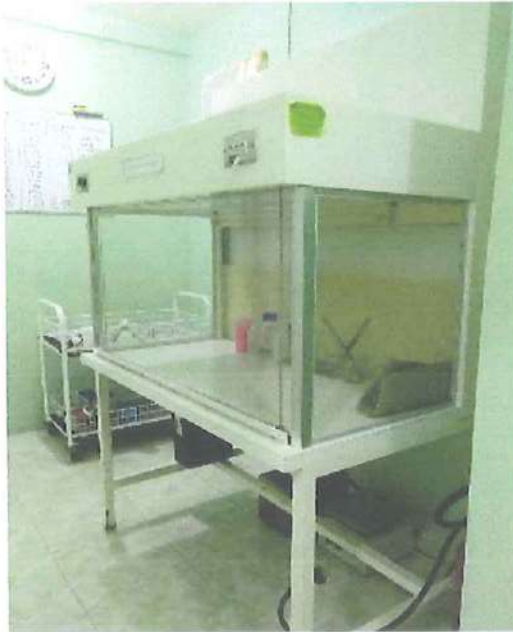
Laminar Flow Hood